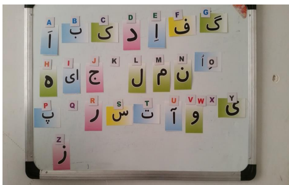
Picture 4, using Persian equivalent as mnemonic

After learning the letters and corresponding sounds, she was made to make the mono syllabic regular words using tactile, kinesthetic and visual senses (Picture 5). Based on MSL strategies Language concepts were taught in logical, sequential steps from simple to more complex tasks.