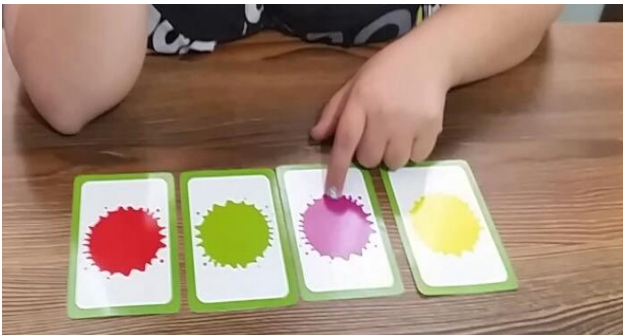
Figure 2, Flash cards

Considering her mental age (six years old) based on "Draw-a-Person tests", American First Friend 1 published by Oxford University Press was chosen. It is a phonemic program designed to develop letter recognition skill and letter formation. This book comprised of 10 units focusing on learning alphabets and vocabularies. Other material used along with the book were flashcards, Persian and English magnet alphabets and a magnet board. (Pictures 2 & 3).