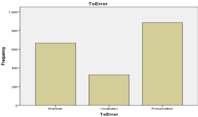
Figure 2. Types of errors

In order to examine the significance of the differences between the frequencies of the types of errors and their expected frequencies, a chi-square goodness-of-fit test was run. As shown in Table 8, the frequencies for vocabulary and pronunciation were noticeably different from their expected frequencies while the number of grammatical errors receiving CF was close the expected frequency for this error type. Based on the table, errors of pronunciation were treated more than expected, while errors of vocabulary were addressed greatly less than expected. According to the result of the chi-square test (Table 9), there were significant differences between the observed and expected frequencies for types of errors being treated through CF, X^2(2, n= 1878) = 244.1, p = .000 .