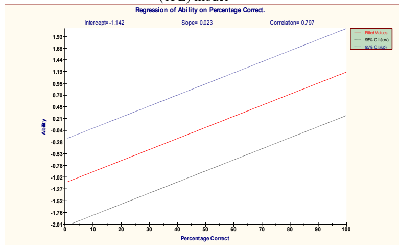
Figure 1 Regression of ability on percentage correct for the one-parameter logistic (1PL) model

After checking the data for unidimensionality, Bilog software was used to analyze the data. All the details on item and person statistics were obtained. The following figures show the correlations between person statistics in IRT and CTT for all three models. In other words, the Bivariate Plot provides a regression of ability on the percentage correct. A Bivariate Plot graphs the relationship between two variables that have been measured on a single sample of subjects. Such a plot permits the researcher to see at a glance the degree and pattern of relation between the two variables. On a Bivariate Plot, the abscissa (X-axis) represents the potential scores of the predictor variable and the ordinate (Y-axis) represents the potential scores of the predicted or outcome variable. Each point on the Bivariate Plot shows the X and Y scores for a single subject. This is what is meant by "Bivariate" Plot i.e. each point represents two variables.