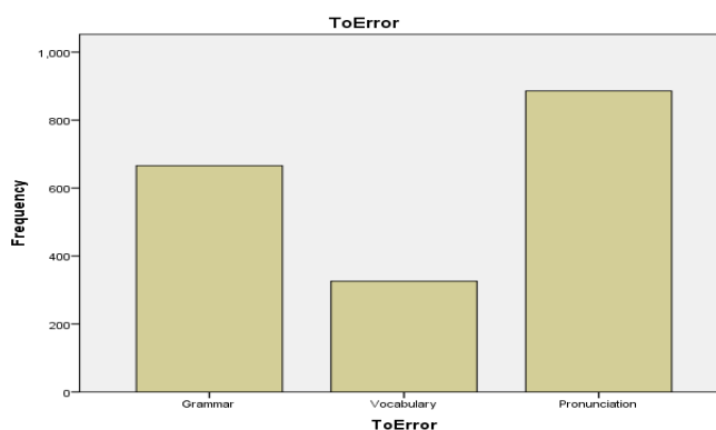
Figure 2. Types of errors

In order to examine the significance of the differences between the frequencies of the types of errors and their expected frequencies, a chi-square goodness-of-fit test was run. As shown in Table 8, the frequencies for vocabulary and pronunciation were noticeably different from their expected frequencies while the number of grammatical errors receiving CF was close the expected frequency for this error type. Based on the table, errors of pronunciation were treated more than expected, while errors of vocabulary were addressed greatly less than expected. According to the result of the chi-square test (Table 9), there were significant differences between the observed and expected frequencies for types of errors being treated through CF, X^2(2, n= 1878) = 244.1, p = .000 .