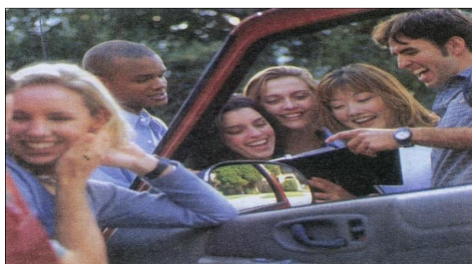
Figure 5: Interchange Student's Book 3 (Richards, 2005, p. 73).

As is seen in Figure 5, the three women placed between the two men are arranged in a symmetrical fashion because their size, their distance from each other and their orientation towards the vertical/horizontal axes are similar. Therefore, they are depicted as equal to and subordinates of a classificational process in which the superordinate is female friends . The structure of this classificational process is a covert taxonomy because the superordinate is not explicitly mentioned or written on the image, but rather it can be inferred from the symmetrical composition of the participants. The two men are also placed in a symmetrical composition with respect to each other: their size and distance from female participants are almost equal and their orientation towards the vertical/horizontal axes is symmetrical. Thus,