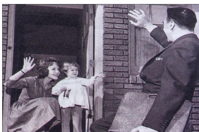
Figure 7: Interchange Student's Book 2 (Richards, 2005, p. 14).

The two female participants in Figure 7 are, on the one hand, separated from the man by the framelines formed by the right edge of the door and, on the other hand, they are represented as belonging to the context of home because they are positioned within the frame formed by the edges of the door and also the dark shade behind them. In fact, the edges of the door and the dark part within the frame of the door divide the picture into two parts: home and outside . The man is depicted as belonging to outside (activities) while the females are shown as belonging to home; these representations also seem to be stereotypical.