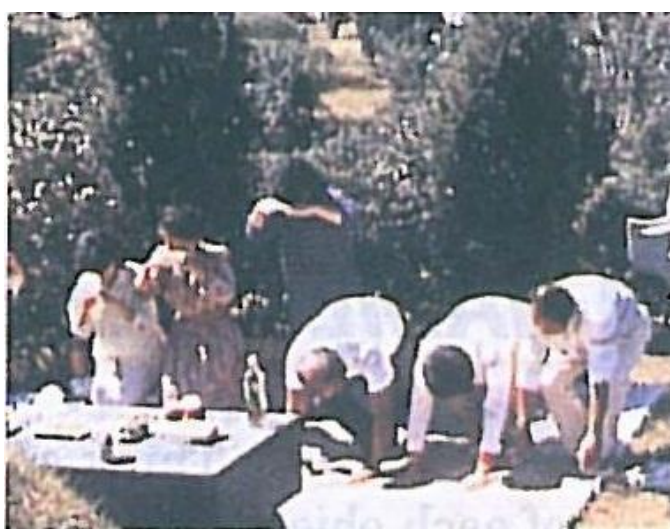
Figure 9: Interchange Student's Book 2 (Richards, 2005, p. 55).

Figure 9 shows three men and three women while doing a part of a Korean custom. The represented participants of this photograph are depicted in active roles since all of them are shown in narrative representations involved in non-transactional action processes. Non-transactional action includes only actors and does not have any goal for which the action may be done. In fact, non-transactional action functions like sentences with intransitive verbs. A sentence with the continuous tense, e.g. 'They are praying before the graves of their ancestors', would be an appropriate equivalent of this representation if one wishes to translate it into the verbal mode. However, in this active representation, the three women are disconnected from the male participants by framing. In this photograph, framing is achieved by the discontinuity of the white color of men's clothes, the framelines formed by the white cloth spread on the ground and the