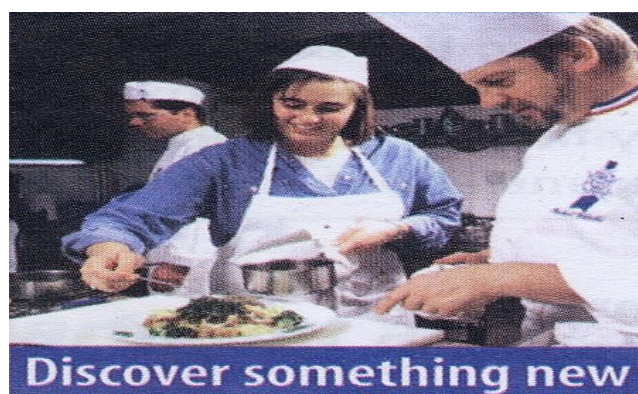
Figure 4: Interchange Student's Book 2 (Richards, 2005, p. 30).

An analysis of information value in the same figure shows that the female participants as consumers are placed on the left side as given. The female participants are shown as though they are already known as consumers. The male participants, on the other hand, occupy the right side of the image as new, the part of information with which the viewer is not familiar yet. This may be ideological because unlike women as consumers , men as consumers are placed in the part of the information which is strange, 'at issue' and 'contestable' (Kress & van Leeuwen, 2006, p. 181). Therefore, the trait of consumerist is more attributed to women in that they occupy the left side as given in both pictures.