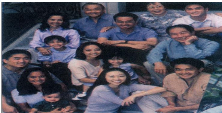
Figure 2: Interchange Student's Book 1 (Richards, 2005, p. Interchange 5).

According to the title of the relevant exercise in the textbook, Figure 2 depicts the members of a family who constitute the represented participants of this image. With respect to the female participants, vectors are formed by the arms of five women; thus, there are five action processes identified in this picture.