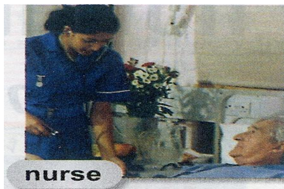
Figure 1: Interchange Student’s Book 1 (Richards, 2005, p. 15).