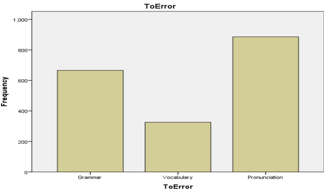
Figure 2. Types of errors

In order to examine the significance of the differences between the frequencies of the types of errors and their expected frequencies, a chi-square goodness-of-fit test was run. As shown in Table 8, the frequencies for vocabulary and pronunciation were noticeably different from their expected frequencies while the number of grammatical errors receiving CF was close the expected frequency for this error type. Based on the table, errors of pronunciation were treated more than expected, while errors of vocabulary were addressed greatly less than expected. According to the result of the chi-square test (Table 9), there were significant differences between the observed and expected frequencies for types of errors being treated through CF, X^2(2, n= 1878) = 244.1, p = .000 .