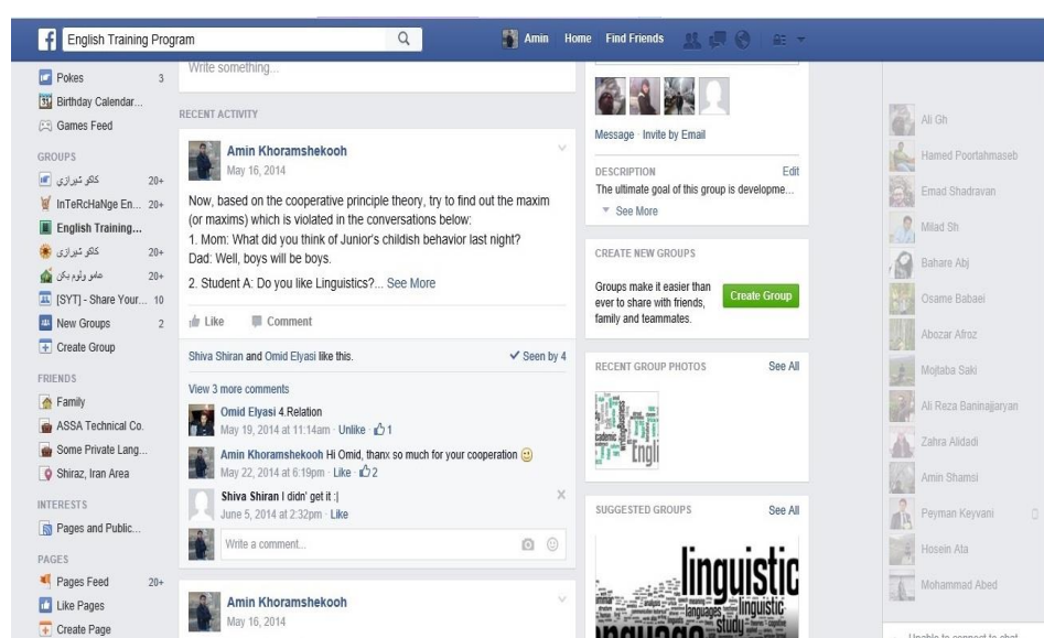
Figure 2 The ACMC group's virtual instructional environment

The participants of the control group, also, received the instructional materials two times a week (each time about half an hour) through traditional teacher-fronted classroom setting. In each session, they were provided with a dialogue containing implicatures in a specific context. Then, they were encouraged to interpret the dialogue and discuss it with their peers. Afterwards, they were given meta-pragmatic information about how to interpret each implicatures type.