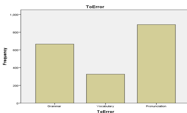
Figure 2. Types of errors

In order to examine the significance of the differences between the frequencies of the types of errors and their expected frequencies, a chi-square goodness-of-fit test was run. As shown in Table 8, the frequencies for vocabulary and pronunciation were noticeably different from their expected frequencies while the number of grammatical errors receiving CF was close the expected frequency for this error type. Based on the table, errors of pronunciation were treated more than expected, while errors of vocabulary were addressed greatly less than expected. According to the result of the chi-square test (Table 9), there were significant differences between the observed and expected frequencies for types of errors being treated through CF, X^2(2, n= 1878) = 244.1, p = .000 .