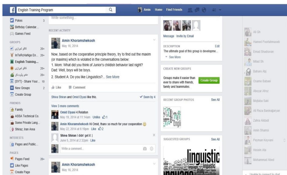
Figure 2 The ACMC group's virtual instructional environment

The participants of the control group, also, received the instructional materials two times a week (each time about half an hour) through traditional teacher-fronted classroom setting. In each session, they were provided with a dialogue containing implicatures in a specific context. Then, they were encouraged to interpret the dialogue and discuss it with their peers. Afterwards, they were given meta-pragmatic information about how to interpret each implicatures type.